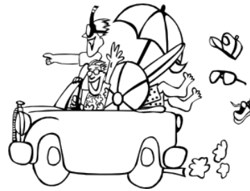
Special family vacation

Think about the family you grew up in. In what ways was it amazing? How was it average? Mmm, did it ever get below average? Consider some of the memory joggers below to get you thinking about the different aspects of your family. Then share a few of the ideas with the group, especially focusing on times when your family was amazing.