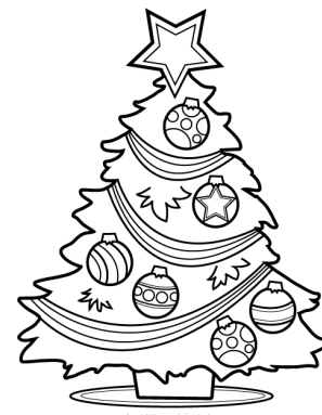
Memorable holidays (eg. Christmas)