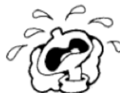
Soap Opera Emotions ran high but lots of love was shared.