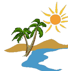
Oasis Peace and quiet, rest and relaxation