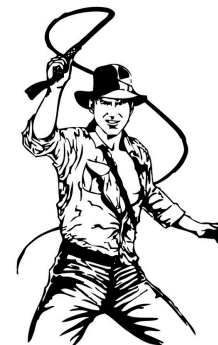
Action Movie Fast paced, high adventure.