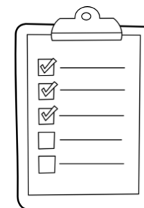
Heavy schedule So much to do with so little time.