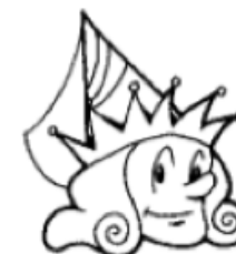
Fairy Tale Battle between good and evil but we lived happily ever after.