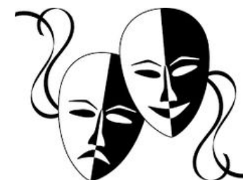
Comedy of Errors How could so many things go wrong?