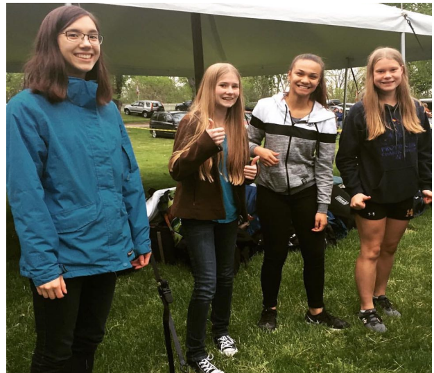
Pitch 'n Praise