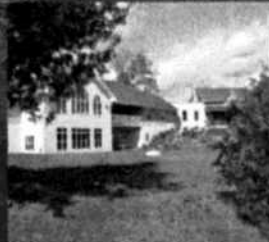
Woodhouse Retreat Centre

We're returning to the beautiful Woodhouse Retreat Centre at Hidden Acres for a mini retreat to relax, connect, and be encouraged.